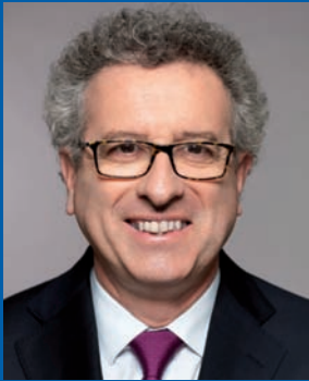
HE Pierre GRAMEGNA Minister of Finance, Grand Duchy of Luxembourg

MINISTRY OF FINANCE 3, rue de la Congrégation L-2931 Luxembourg